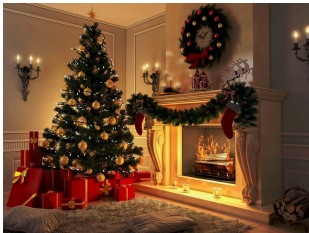
Decorated Christmas tree in front of a fireplace.