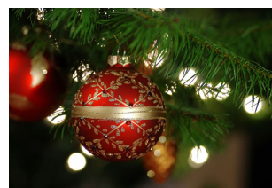
Red and gold Christmas tree ornament.