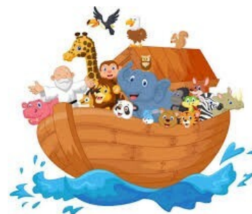
Cartoon Noah's Ark

In the world we live in today, we have a flood of information each day. I did stop to pause when I read this quote, "Never be afraid to try something new. Remember, amateurs built the Ark ... professionals built the Titanic." This anonymous quote made me stop to think. We know from research that it takes roughly 10 years to become an expert. It requires studies in the subject as indicated, practicing your craft and being mentored by experts in the field. Becoming an expert does not always guarantee success as was seen by what happened with the Titanic. The ship was supposed to be unsinkable, but we know that was not true. Amateurs on the other hand, bring new ideas, positivity, eagerness and are generally idealistic. They want to be successful even if it means building an ark to save the animals. New teachers are energetic, innovative, inspired and work hard to connect with their students. As mentors, we must show new teachers how to leverage their strengths and contributions. The Teacher Induction Program focused on high leverage practices is available to all LEAs for induction level special education teachers. Contact your GLRS if interested in participating. Many of us have plenty of experience to be called a professional or even an expert but just remember amateurs bring new life into the classroom. We must invest now to ensure we have strong teachers and leaders for the future.