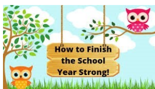
How to finish the school year strong!

- Georgia Home Classroom – A collaboration between GPB Education and GaDOE that began as a response to the pandemic but has since evolved to provide support for educators and families for both in-person and remote learning. All GPB resources mentioned above are linked on the Georgia Home Classroom landing page, and GPB is working with GaDOE to produce more content and enhance the experience for users.