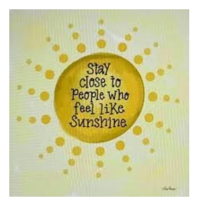
Stay close to people who feel like sunshine.

The trees have leaves again! The beautiful, blooming dogwoods, azaleas and redbud trees have been spectacular this year. Such a gorgeous time of year but it just doesn't last long enough. Although the weather has been cold for early spring, warmer weather is just around the corner. Let the sunshine in!