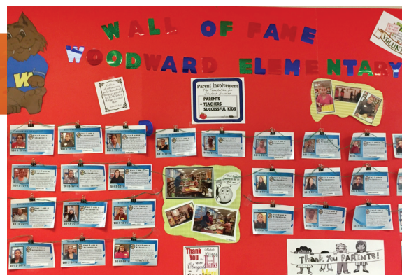
Woodward Elementary School shows appreciation for their numerous parent volunteers with a "Wall of Fame" display board.

With all of the opportunities that Woodward provides to students and parents, it is easy to see why they were chosen as a Family-Friendly Partnership School. Congratulations, Woodward Elementary School!