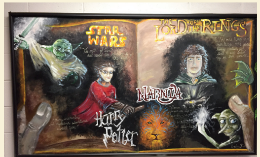
Whimsical, creative displays in the cafeteria (left) and library (right) add to a positive school climate.