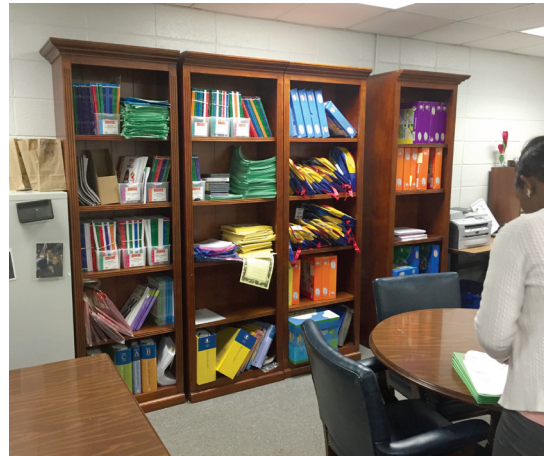
The Parent Resource Center at Peachtree Elementary School.

Peachtree exemplifies the idea that family is not always defined by blood or even commonalities. Congratulations, Peachtree Elementary School!