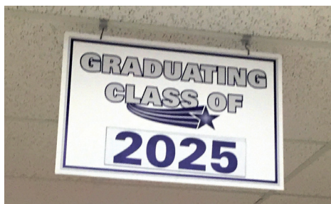
Signage in each grade level pod at Norton Elementary keeps the students' eyes on their academic goals and their graduation year.

a strong Student Support Team structure and multiple options for additional support such as the Saturday School program and the Kindercamp summer program for all rising kindergarten students.