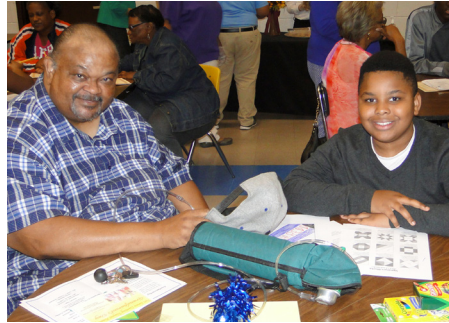
Fort hosted a Grandparents' Day event to engage senior family members in the education of their grandchildren.

Fort has a Parent Coordinator who works with families on site to facilitate their needs. There are computers available in the Parent Resource Center and the Media Center for parents to use along with applications for the Georgia Department of Labor and federal assistance programs when families need them. Parents are offered various learning events throughout the year including Literacy Night, Leadership Legacy Day, Grandparents Day Brunch, Bring Your Family to School Week, and Transition Days for both incoming 6th graders and rising 9th graders. The 9th grade transition training for families focuses on educating parents on topics such as dual enrollment, Career, Technical, and Agriculture Education (CTAE) pathways, and graduation requirements. In addition to these regular opportunities, the principal hosts monthly workshops for families to discuss topics such as the Georgia Standards of Excellence and the advantages of implementing high school courses at the middle school level. The school also provides guides for parents on the Georgia Standards of Excellence each nine weeks which feature the standards to be focused on for that quarter, along with suggestions for families on how to support students academically over the next weeks of school.