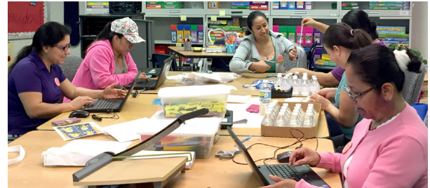
The Parent Resource Center at Hopkins Elementary School.

The Hopkins experience extends beyond the school campus. The Local School Council and Parent Teacher Association provide input on school policies and improvement effort, but they have also worked to develop partnerships with local businesses and community organizations. The school works closely with Parent to Parent of Georgia to provide interpreters at all conferences, workshops, and Individualized Education Program meetings to assist parents with two-way communication about their children's education. HES staff works in cooperation with local library branches to provide the Prime-Time Reading Program for families of struggling readers. Community business sponsors help families to receive library cards, identify at risk students for Saturday school support, which was suggested by parents, and a Saturday Pre-K program.