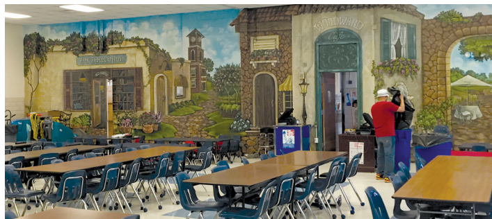
The walls of the cafeteria at Woodward Elementary School have been painted to resemble a village. The painting enhances the school's overall aesthetic and adds to a positive school climate.

WES has also educated parents on reading student data and given them support with questions to use during conferences