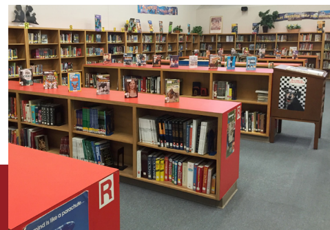
Fort has an inviting library for students and families that is conducive to reading and learning.

Congratulations to “the best middle school in the world,” Fort Service Learning Magnet Academy!