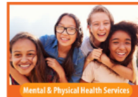
Mental & Physical Health Services