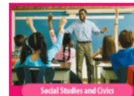
Social Studies and Civics