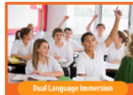
Dual Language Immersion