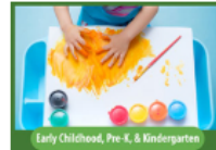
Early Childhood, Pre-K, & Kindergarten