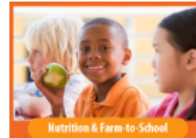
Nutrition & Farm-to-School