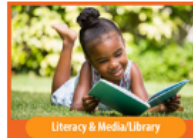
Literacy & Media/Library