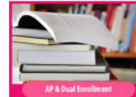
AP & Dual Enrollment