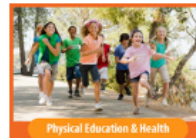
Physical Education & Health