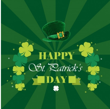
Happy St. Patrick's Day