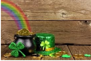
Rainbow leading to a pot of gold.

Watch out for leprechauns, look for four-leaf clovers and always follow a rainbow in search of a pot o'gold. I wish all the very best for each of you. You are loved and appreciated.