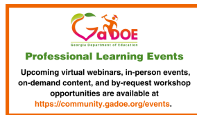
Professional Learning Events