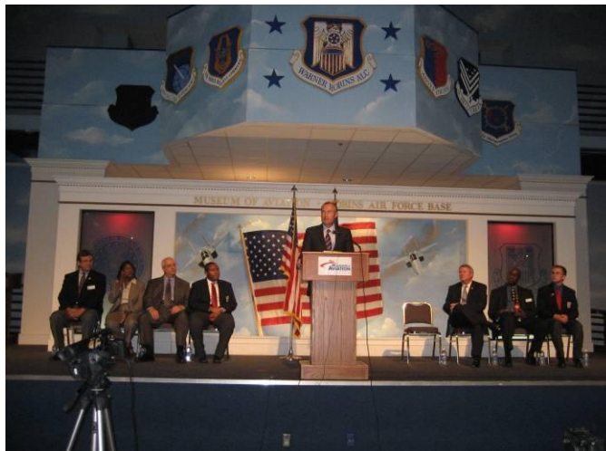
The Real World Design Challenge (RWDC) kick-off event included involvement of teachers and students with the Lt. Governor and other dignitaries at the Warner Robins Air and Space Museum

Teachers have expressed how much the students are learning and how focused they are. There are many opportunities for students to showcase problem solving skills, the design process, the systems model, and other aspects of the Engineering and Technology program. Some of the Georgia Technology Student Association's activities are noted in the following pictures that chronicle some of this year's activities.