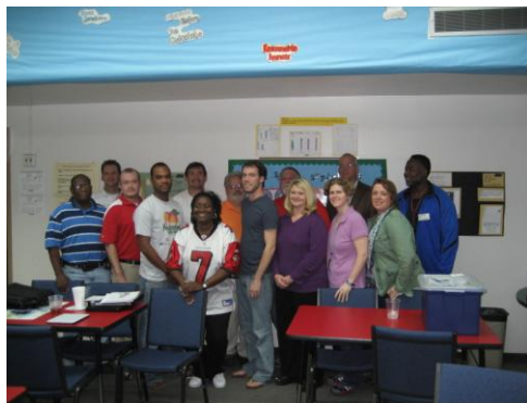
Middle and high school teachers participated in a certification workshop.

The Georgia Engineering and Technology Education (GETEA) Fall Conference featured pre-conference workshops, a vendor show, great teacher presentations, super general sessions, great industry tours such as, (CAT and KIA) and a first-class awards banquet. The conference was held on the campus of LaGrange College.