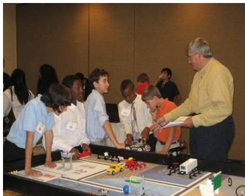
Students Participating in Robotic Events