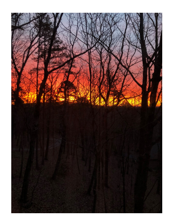
Sunrise through some trees

With each sunrise, we have hope for a new day. Although I grew up in the mountains of North Georgia, I guess I took the beautiful scenery for granted. Returning to the mountains after being away for many years, has really opened my eyes. The picture to the left is of a recent sunrise at my house. Hard to not see the beauty of the richly painted sky as the sun rises to start a new day. A beautiful sunrise is a promise of hope. Always make the most of it!