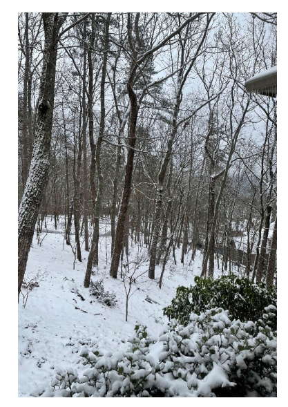
Snow and trees

We often wish for certain things that may also have unintended consequences. I love the snow,