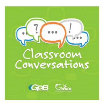
Classroom Conversations logo

The Division for Curriculum, Instruction and School Climate has just released the second podcast encouraging educators to engage students in Computer Science at the elementary level. Please share with administrators and teachers as appropriate.