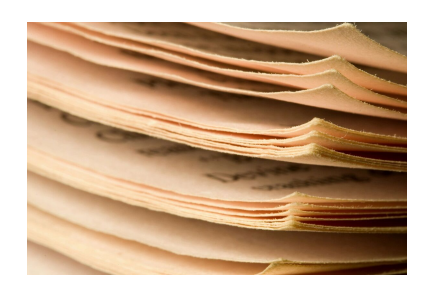
Pages of a book

The GaDOE Dyslexia Informational Handbook has been updated and is available here and on the Dyslexia Webpage . Notable updates include: