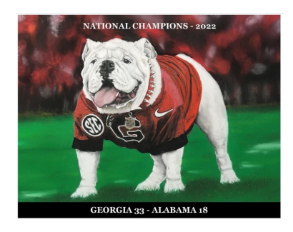
UGA National Champions 2022

How 'bout them DAWGS! I know you will join me in celebrating the outstanding