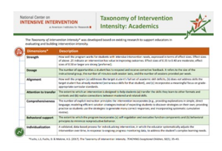
Taxonomy of Intervention Intensity: Academics

Additionally, your District Liaison and Budget Liaison are always available to provide any necessary assistance. We look forward to supporting you in this process.