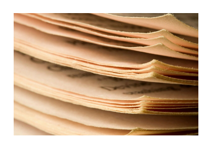
Pages of a book

Thank you in advance for helping us plan effectively to meet your needs by completing this survey by January 21, 2022.