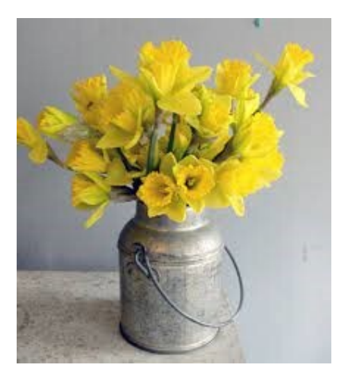
Bouquet of jonquils

Be sure to checkout our new feature called Program Pointers. Each week, our Result Driven Accountability unit will feature short messages with guidance, best practice, compliance and overall general supervision information. This week's tip has a direct link to OSEP's policy guidance. Hope you find this helpful. Let us know if you have a specific suggestion or topic, you would like included.