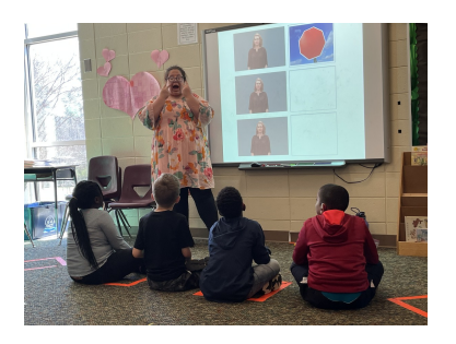
Teacher presenting in front of sitting students

The instructional needs of students in the Regional D/HH program vary from gifted students who access most of their instruction in the general education environment to students who receive the majority of their specialized instruction from a certified D/HH teacher. Beyond meeting the instructional needs of all students, the Regional D/HH Program provides a rich environment of Deaf culture, ASL native language models from Deaf adults, socialization and