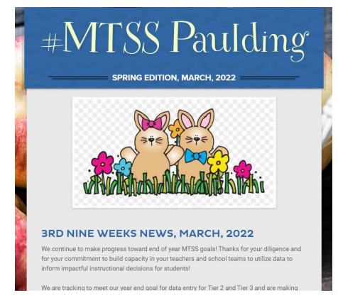
Preview of Paulding County newsletter

We want to shoutout an amazing newsletter from Paulding County. Not only did each of the six district coaches highlight one of the schools they support, but they also are building sustainability. Communication and sharing are key when working to provide solutions and this newsletter showcases one of the many ways we can all work together to provide