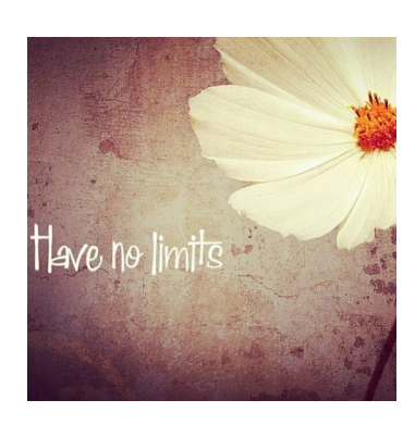
Have no limits

Hope your 4th of July was great! Our weather turned out to be mostly sunny and cool for this time of year. Always wonderful to have time to relax and spend time with friends and family.