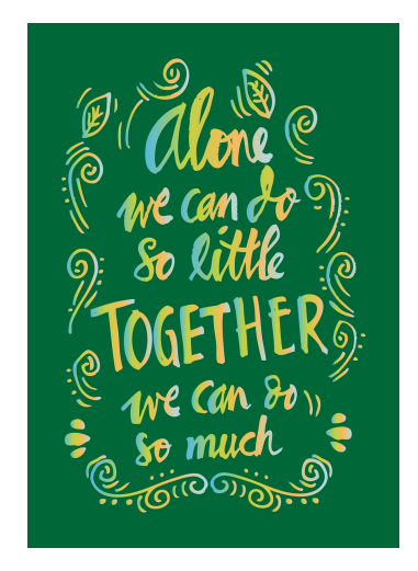
Alone we can do so little. Together we can do so much.

Summer GAEL at Jekyll Island celebrated 50 years as an organization. The greatest benefit of our collective professional groups is the gift of collegiality. If you are not active in G-CASE and GAEL or any of the other affiliates, I encourage you to get involved. Having other professionals with the same professional opportunities and challenges can