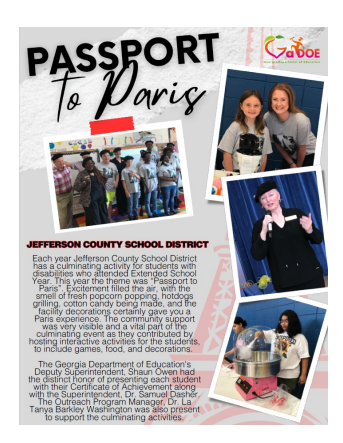
Passport to Paris informational flyer