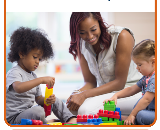
Ask for help