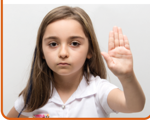
Say, "Please, stop."