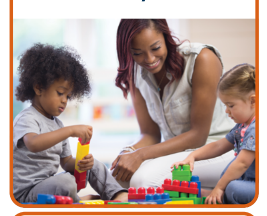
Pide un abrazo