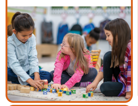
Di: "Por favor, para."