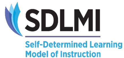
Goal-Setting/Goal Attainment Process