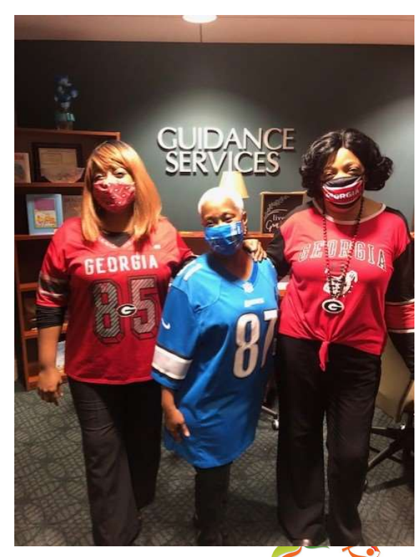
October 21, 2022