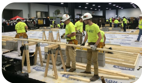
Pictured are high school students competing at the SkillsUSA event at the Georgia International Convention Center.