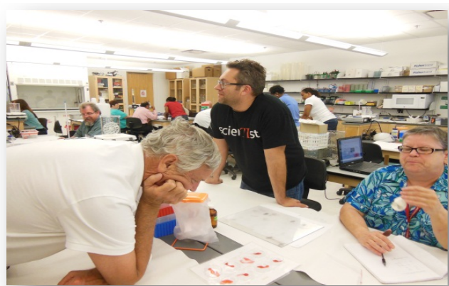
Georgia STEM Institute Atlanta- teachers at Cisco