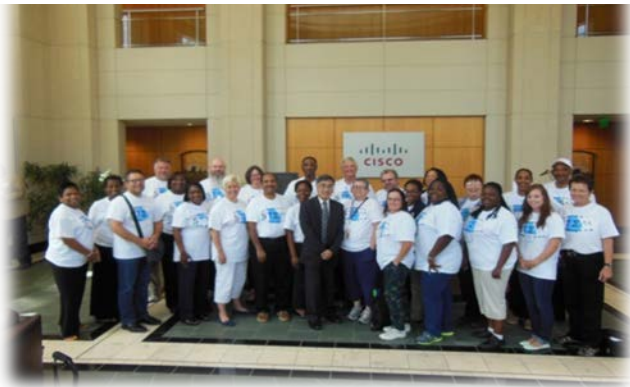
Georgia STEM Institute Atlanta- teachers study biotechnology with GSU BioBus program