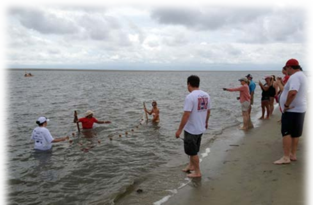
Georgia STEM Institute Savannah-teachers conduct water quality study on Little Tybee Island