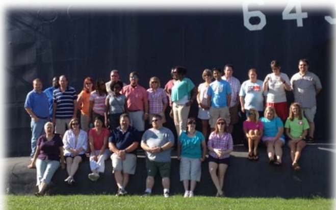
Georgia STEM Institute Savannah-teachers visit the US Navy Trident Submarine in Kings Bay

The third year of the Georgia STEM Institute, a CTAE program that brings CTAE, math, and science teachers together for a week in Savannah or Atlanta to visit STEM industries, was completed this summer. Teams of teachers in the Savannah Institute visited Gulfstream and JCB Construction Machines, worked with the National Oceanic and Atmospheric Administration, and toured a Trident Missile Nuclear Submarine at the US Navy Base in Kings Bay, Ga. The Atlanta STEM institute treated teachers to visits with Cisco, Hartsfield Jackson Airport, Delta TechOps, CryoLife, the Georgia Bureau of Investigation, Quality Technology Services, the Food Processing Lab at Georgia Tech, the Georgia State University BioBus lab, and the Chattahoochee Riverkeeper. Both Institutes were “Gamified” this year, which means teachers earned digital performance badges for completed tasks throughout the week-long program. Applications for the Georgia STEM Institute are available in March each year on the STEM Georgia website at http://stemgeorgia.org .