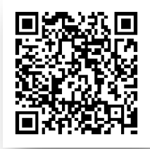
QR code for CTAE home web page