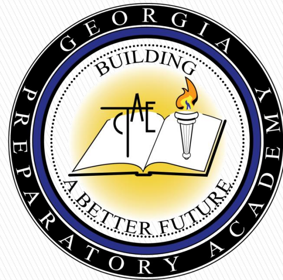
Georgia Preparatory Academy