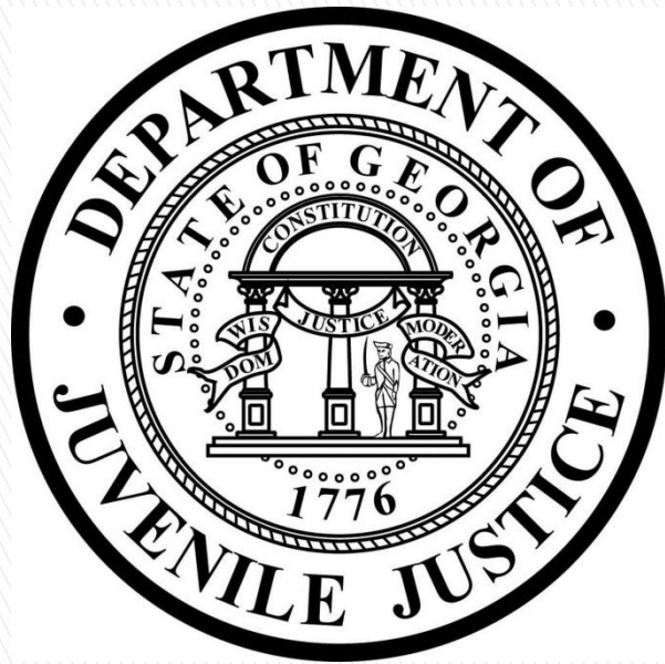
Department of Juvenile Justice