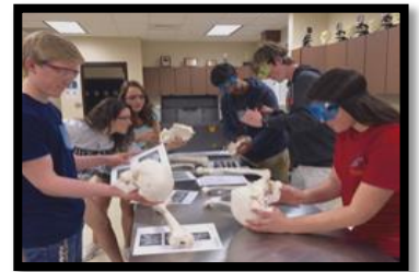
SkillsUSA students display their skill in the Law and Justice Pathways program at Cambridge High School.