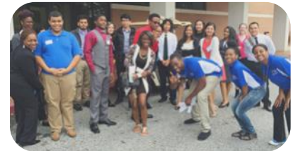
Pictured are Clayton County Work-Based Learning (WBL) students with Clayton State University Student Ambassadors (students in blue shirts to right) at the WBL Success Seminar.