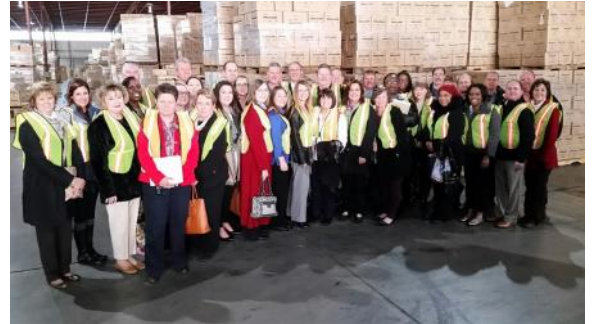
Pictured is the CTAE state staff visiting the Georgia Ports Authority.