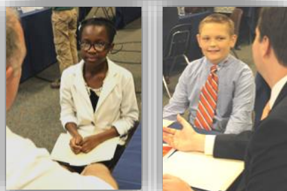
Pictured are fifth grade students from Marietta Center for Advanced Academics, attending Career Day.