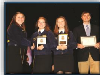
Pictured are FFA award winners from the 88th Georgia FFA Convention.

For more information about the 88 th Georgia FFA Convention, visit www.georgiaffa.org , select the FFA tab, and then find the Convention link.