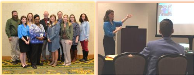
Pictured are Georgia Agriculture teachers presenting at one or more sessions for the annual NAAE Convention.