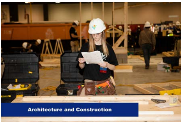
Architecture and Construction

The main change in Architecture is that the introductory or foundation course is now called Introduction to Drafting and Design. Architectural Drawing I and II follow as the 2 nd and 3 rd courses.