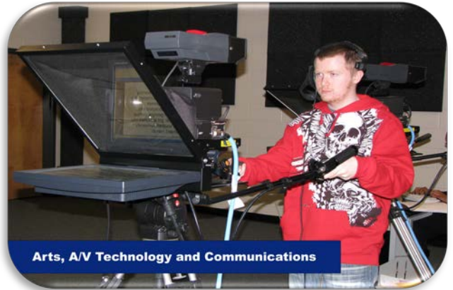
Arts, A/V Technology and Communications

The name change from Broadcast Video Production (BVP) to Audio-Video Technology and Film (AVTF), which mirrors the cluster name at the national level, is the biggest change in this cluster. In addition, this pathway will incorporate more of the media industry than broadcast production.