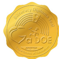
Georgia's Seal of Biliteracy was established in 2016.