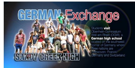
German Students from Sandy Creek participate in summer exchange opportunity.