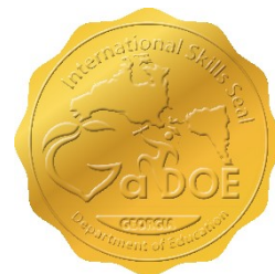
Georgia's International Skills Diploma Seal was established in 2015.