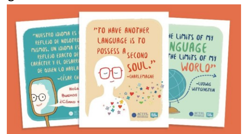
Get your free world language posters today!