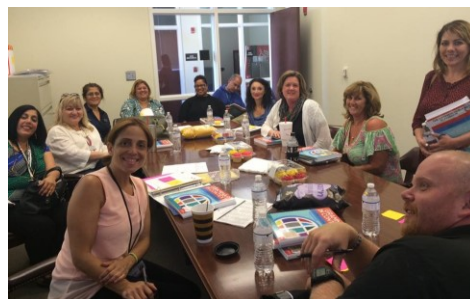
World Language teachers in Henry county gather together to collaborate!