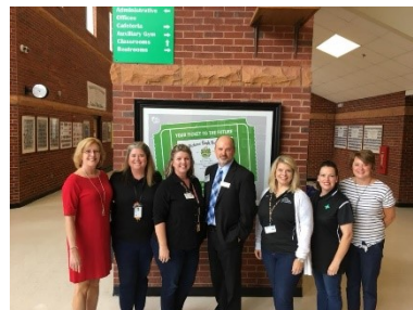
Come join us on Oct 27th at Pickens High School for the World Language Fall Forum!