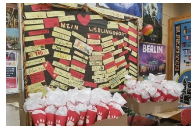
Schultueten welcome German students back to school at Dalton High School.