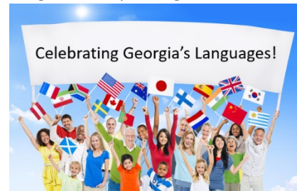
Join us in a year-long celebration of languages in Georgia! #LearnLanguagesInGa