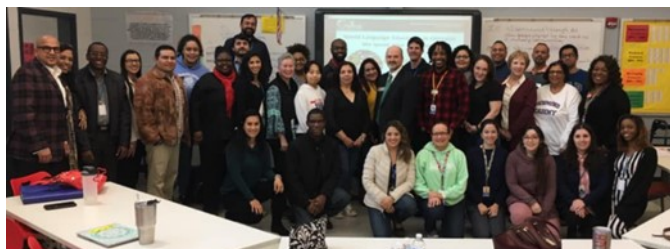
We had a great time sharing with the wonderful WL teachers in Richmond county this month!