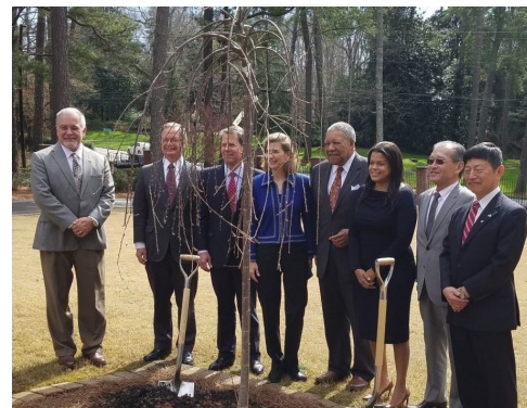
Japanese Consulate of Atlanta celebrates 45 years!