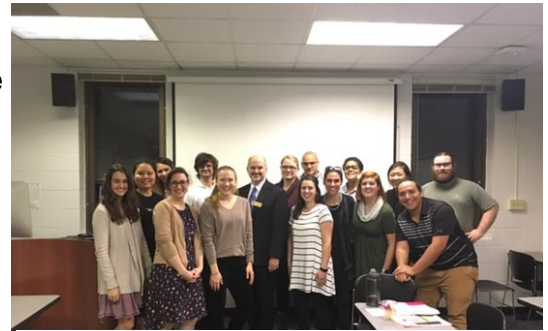
We welcome these students from UGA as they become part of Georgia's family of world language educators!

Have you heard of the 2019 2nd Annual Southeastern United States Korean Speech · Quiz Contest! Now open to MS and HS students from across Ga! Find out more at this link.