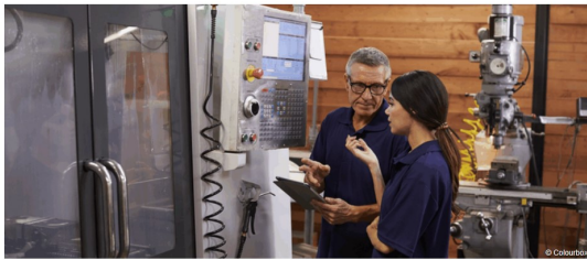
MEIN BERUF IST DER BESTE!