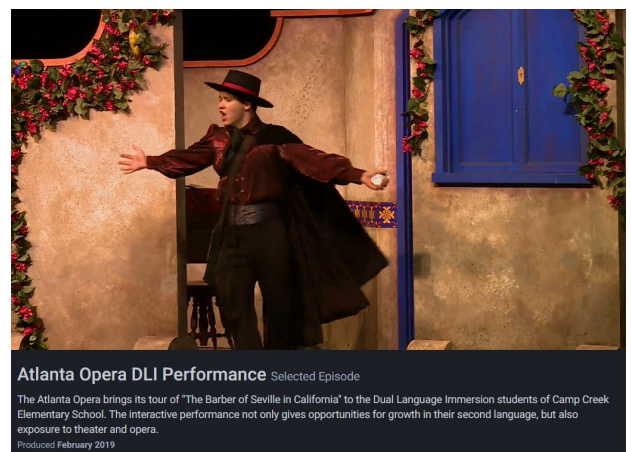
Atlanta Opera DLI Performance Selected Episode

The Atlanta Opera has been performing for Gwinnett County Public Schools for over 30 years. This year is the first year they teamed up with the Dual Language Immersion Program. See a video and find out more by following this link.