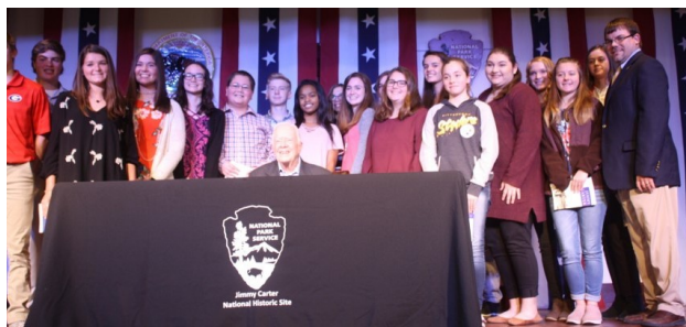
Lanier County High School students with President Carter

What better way to spend Presidents Day than with former President Jimmy Carter and First Lady Rosalynn Carter at the Jimmy Carter National Historic Site in Plains, Georgia! Of the more than 400 people in attendance; 223 were students from across Georgia. Ten of those lucky students had the opportunity to pose questions to President and Mrs. Carter.