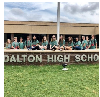
Dalton High School students head to Germany this summer!