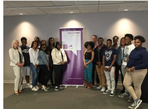
Global Youth Ambassadors Program gets underway at the Goethe-Zentrum Atlanta.