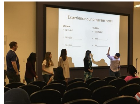
STARTalk Teachers begin teaching Chinese & Turkish on first day at Agnes Scott College