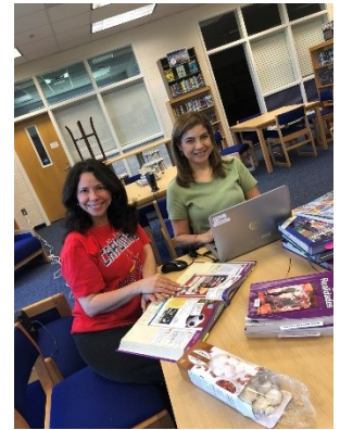
World Language Teachers in Henry County planning for next school year during the summer.