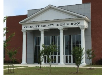
Students from Colquitt County HS earned the first Seals of Biliteracy for the county this reporting cycle.