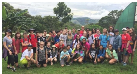
World Language Academy students on the go in Costa Rica.