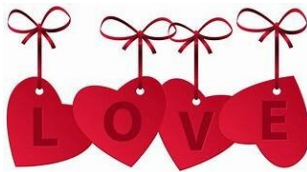
Hearts spelling out LOVE

Applications within the MyGaDOE portal and SLDS will be undergoing maintenance starting on Friday, February 9 at 5 p.m. through Sunday, February 11. All applications will be available on Monday, February 12.