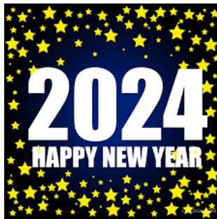
2024 Happy New Year

The application will be available in February for Summer Grow but start thinking of great candidates for the program now.