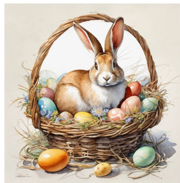
Easter bunny with colorful eggs in a basket.

I hope you enjoy the video from 11 Alive News coverage of the Marietta City Schools' Special Education Teacher Induction Graduation Ceremony held on