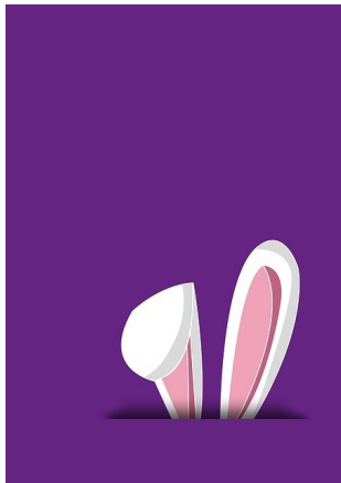
Purple background with white bunny ears.

The eblast is packed with information today. For many school districts, spring break is scheduled for next week. Please take time to submit a capacity building grant. The application takes less than 5 minutes to complete. An important note - the funds will be available for a full year! Use this opportunity to expand your resources, interventions or professional learning to support students with disabilities.