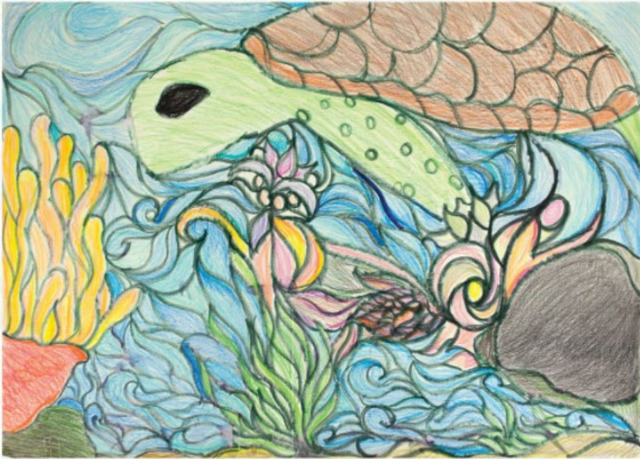
Featuring Artwork by Visually Impaired and Blind Artists American Printing House for the Blind, Inc.