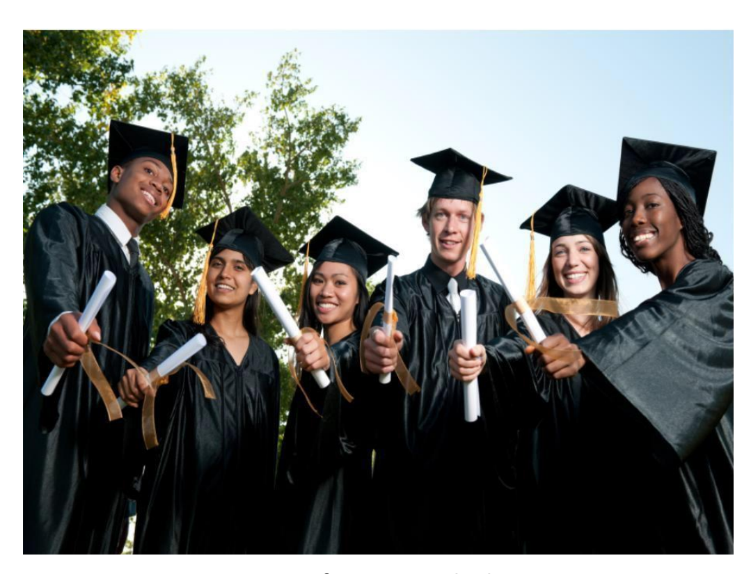
Department of Exceptional Education