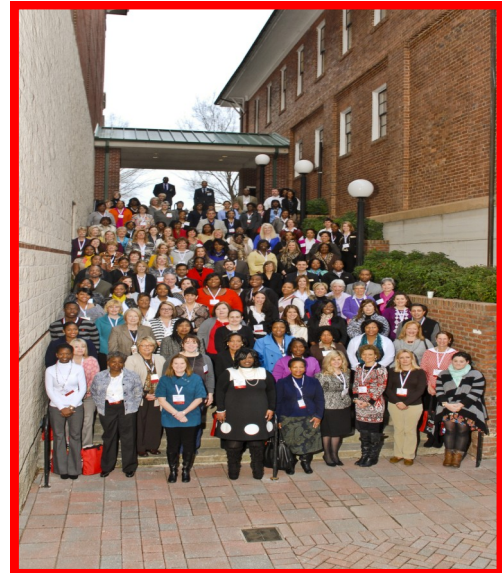
Georgia's 21st Century Community Learning Center Family!